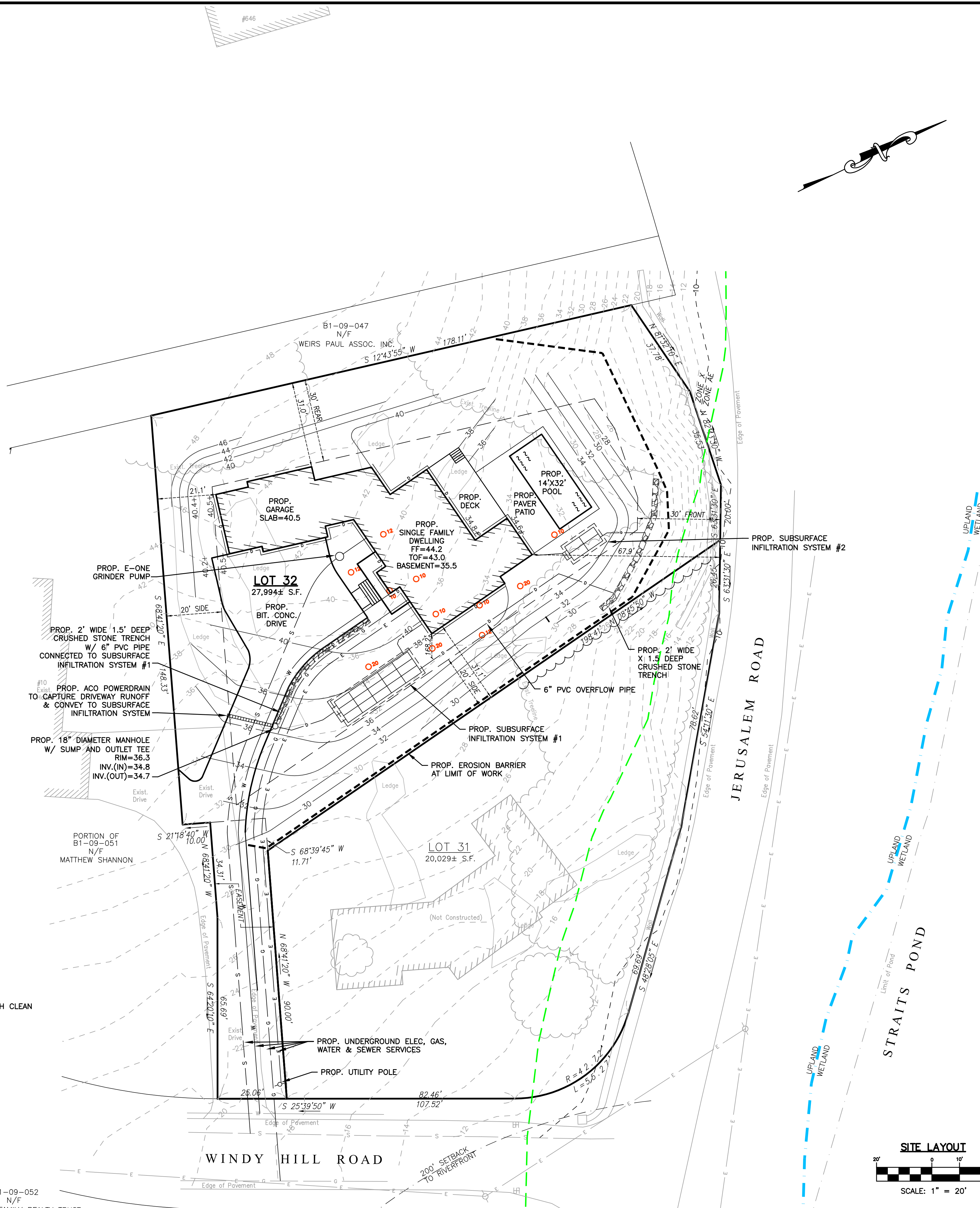
SUBSURFACE INFILTRATION SYSTEM NOT TO SCALE

B1-09-052 N/F CARROLL FAMILY REALTY TRUST